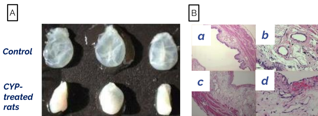
Figure 2: A) Representative images showing the inflammatory effect of CYP on bladders of CYP-treated rats versus control rats (adapted from Giuliano F et al. 2006). B) Representative HE staining in control rats with an intact urothelium (a,b) and in CYP-treated rats with an accumulation of inflammatory cells, oedematous changes, and urothelium haemorrhage (c,d). a,d \times 40 ; b, c, \times 200 (Pelvipharm, internal data).